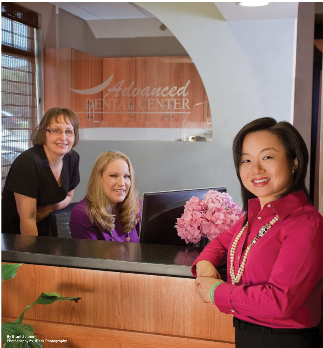
By Grant Zellner